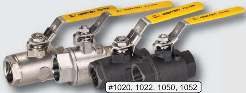
#1020, 1022, 1050, 1052