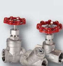
#221, 222, 223