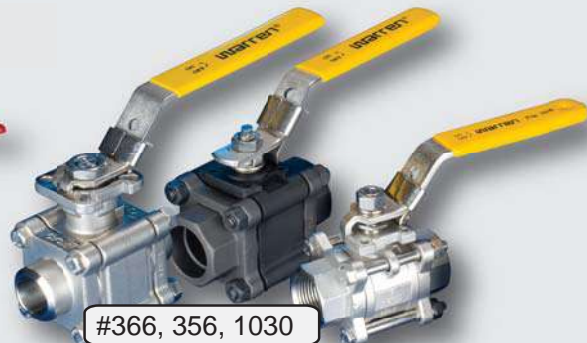
#366, 356, 1030