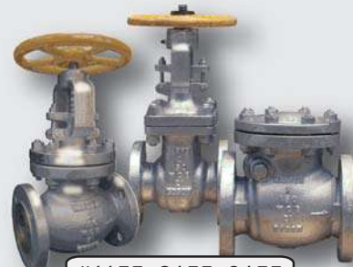
#1155, 2155, 3155