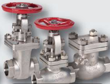
#1156-T, 2156-T, 3156-T